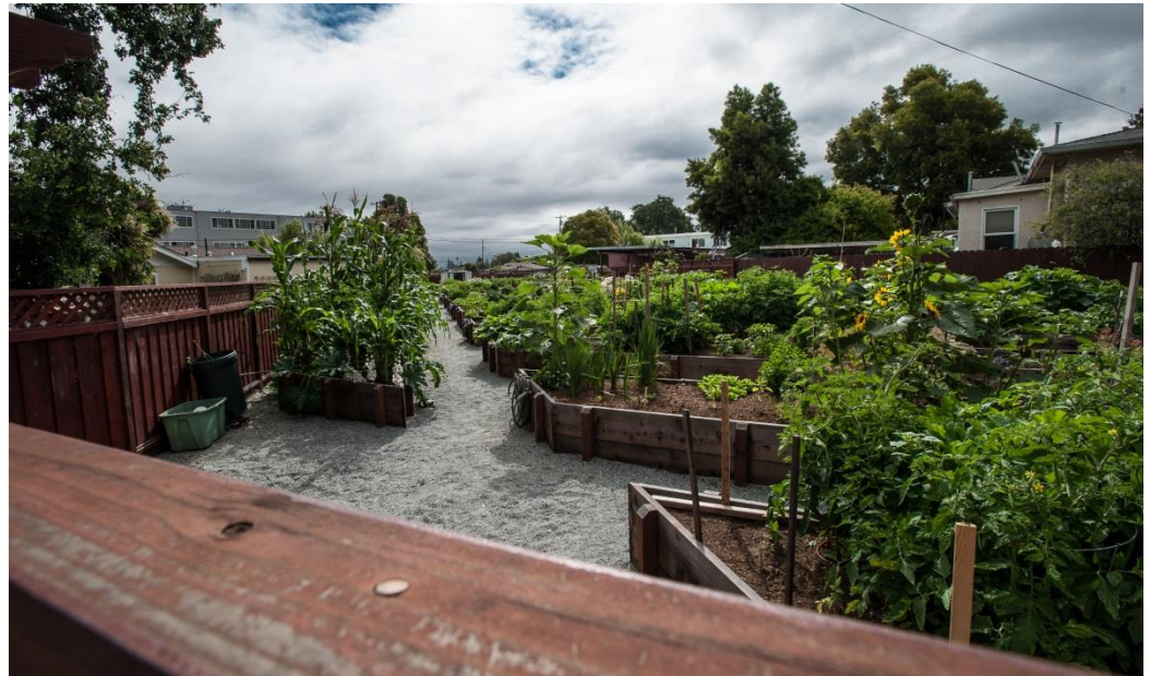
ST FRANCIS CENTER