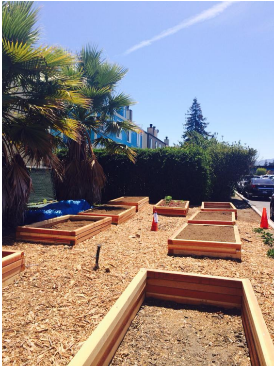
FAIR OAKS HEALTH CENTER